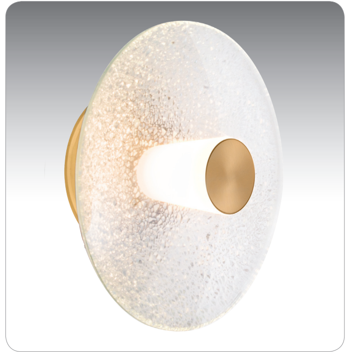
HOPECL (TEXTURE/CLEAR WITH INNER OPAL)